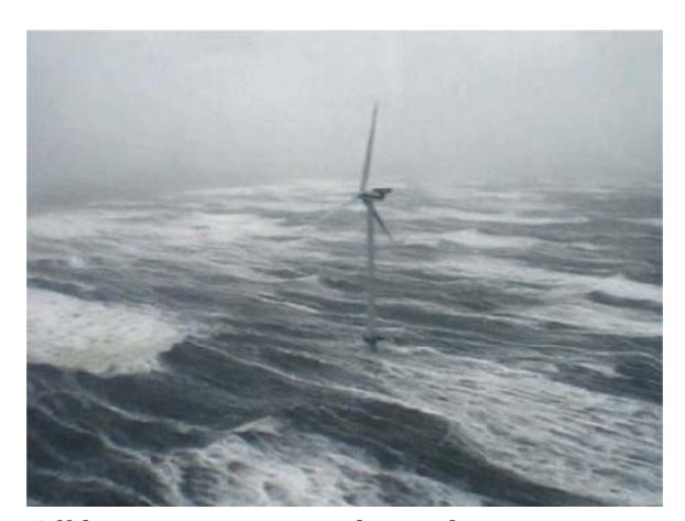
Offshore operations can be costly

Rising carbon-dioxide concentrations threaten catastrophic climate change and ocean acidification. Carbon-free energy sources such as offshore wind power are plentiful and cheap, but their higher commercial cost relative to conventional carbon-emitting sources provokes debate. In order to better understand and participate in these debates, it is valuable to understand the factors determine the cost of offshore wind energy, as well as the range of expected values for that cost.